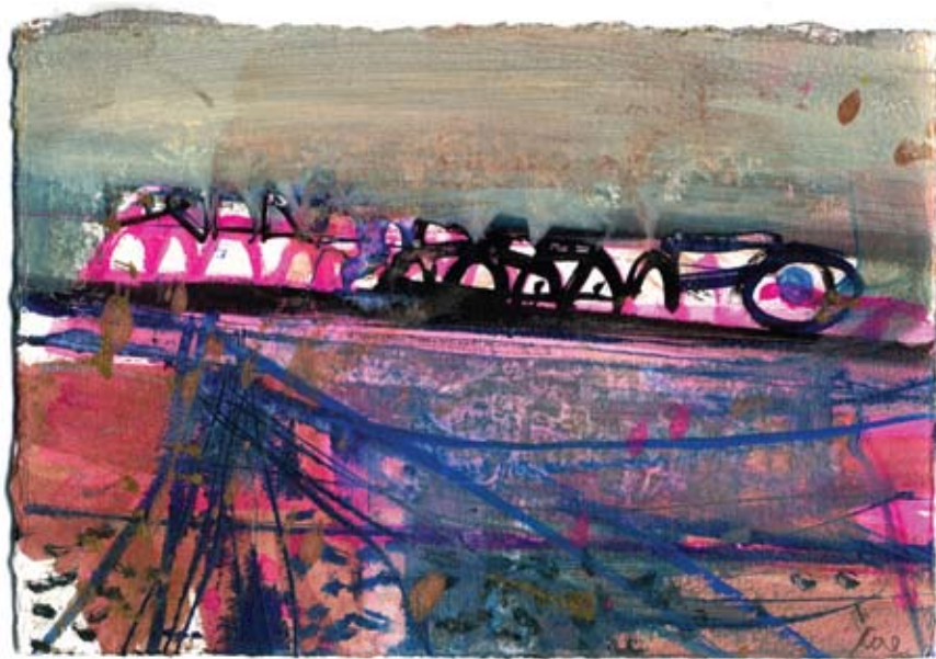
24. Pier Wall mixed media on handmade paper 16 x 22.2 cm