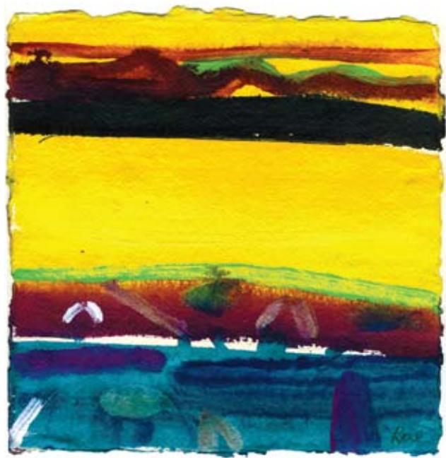
14. Roywell Yellow mixed media on handmade paper 21.3 x 21.3 cm