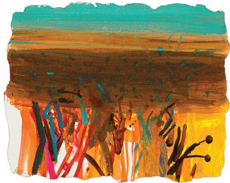
15. Vaucluse Vineyard mixed media on handmade paper 25 x 33 cm