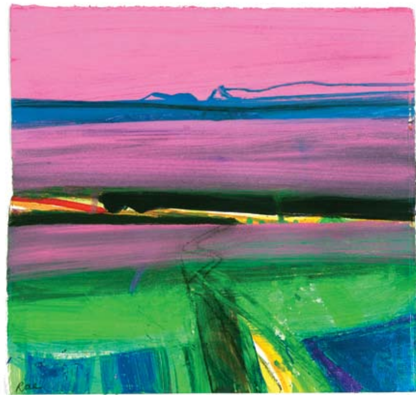
17. Sea Path - Lacken mixed media on handmade paper 36 x 38 cm