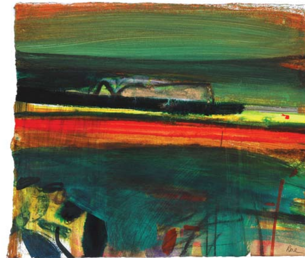
2. Dark Bay – Skall mixed media on handmade paper 57 x 65 cm

Barbara's sketchbooks give an extraordinarily personal insight into her first sources of inspiration, and her creative processes. They reveal her strong drawing of landscape, alongside photographs and touching collages of loved things. She is extremely attached to these sketchbooks and refers to them as her 'diaries' – so the sketches are not for sale. However this collection of paintings shown to complement the sketchbooks are available. They show how close the link is between the immediacy of the sketches and the dynamism of the larger scale finished paintings. We can enjoy in them the themes that are so important in Barbara's work such as the marks and history of human activity in the natural world, alongside her glorious celebration of colour.