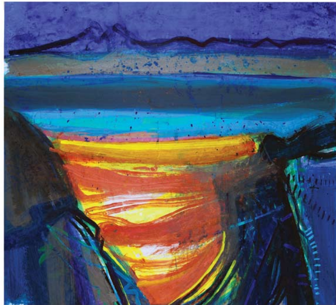
7. Low Tide towards Raasay mixed media on paper 100 x 129 cm