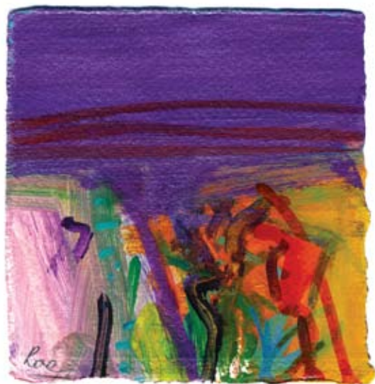
27. Late Autumn Maubec mixed media on handmade paper 14.2 x 14 cm