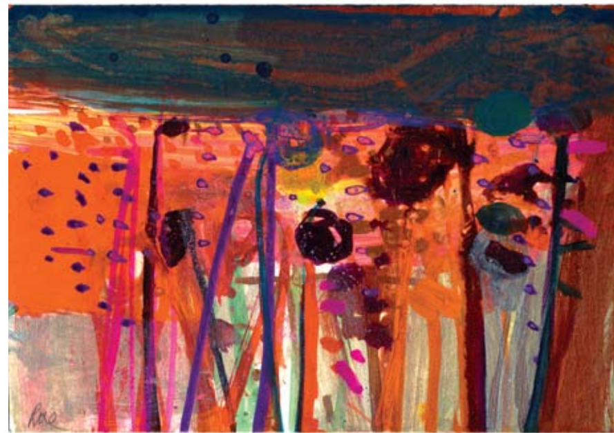
19. Last Sunflowers – Robion mixed media on paper 15 x 21 cm