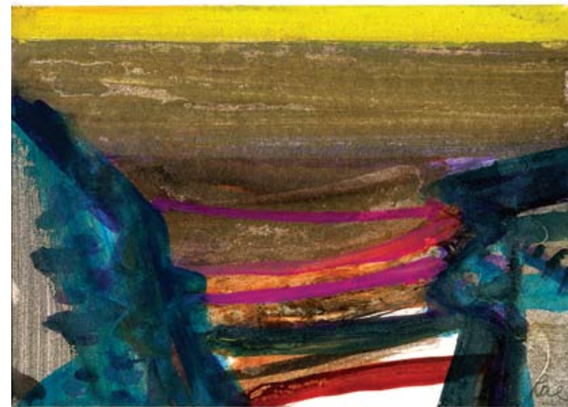
23. Dark Bay mixed media on paper 15 x 21 cm