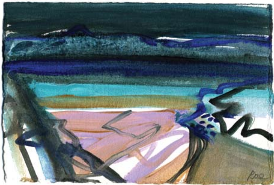
12. Low Tide - North West mixed media on handmade paper 15 x 21 cm