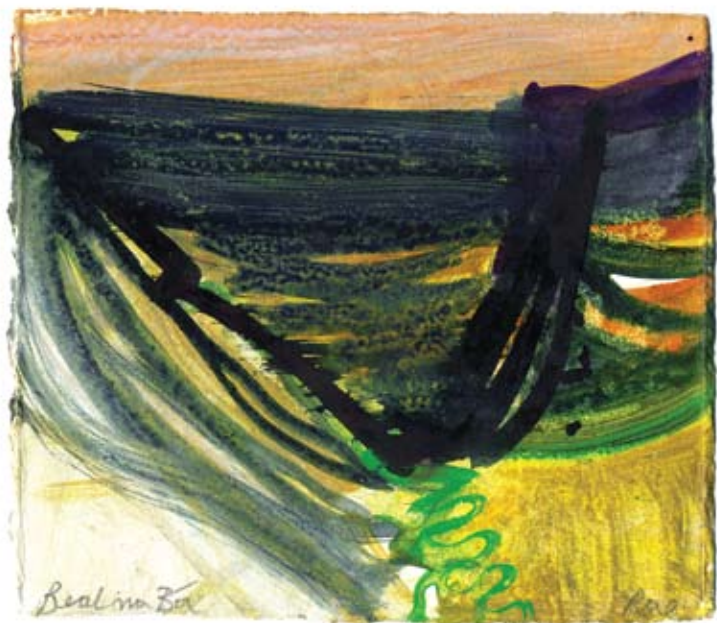
10. Bealach na Ba mixed media on handmade paper 18.3 x 21.2 cm