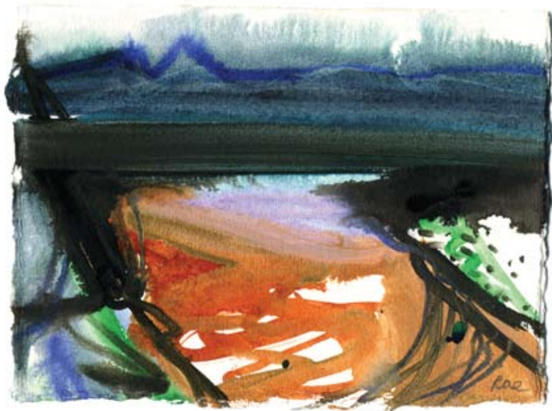
16. Winter Bay mixed media on handmade paper 15 x 21 cm