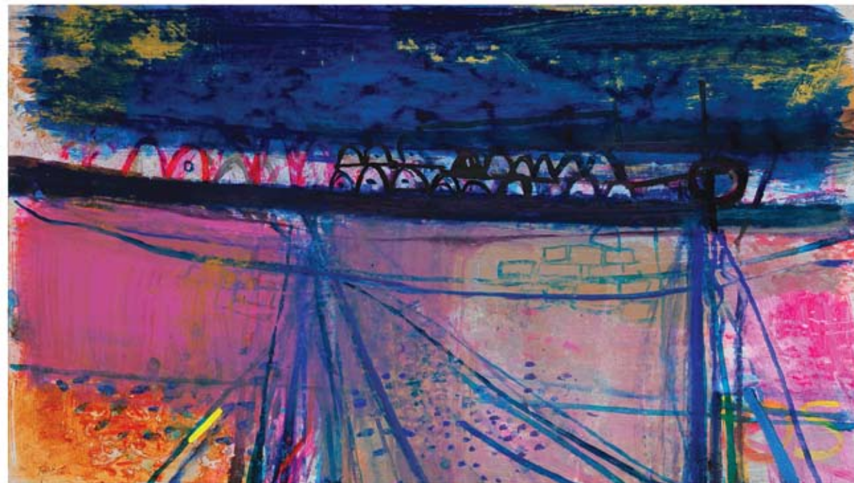
9. Harbour Wall - Laide mixed media on paper 77 x 131 cm