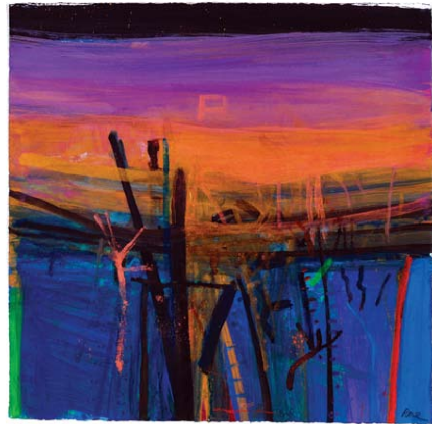
25. Robion Gold Vineyard mixed media on handmade paper 57 x 65 cm