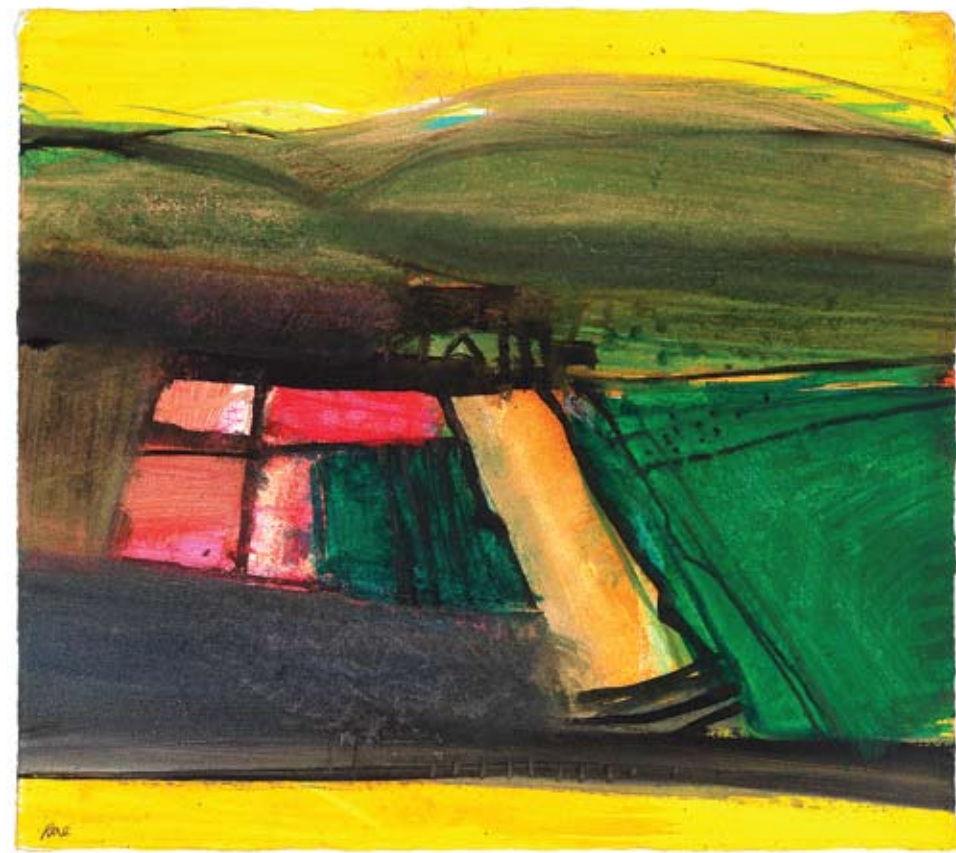
11. Fields Yesnaby mixed media on handmade paper 57 x 65 cm