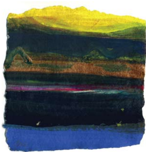
26. Raasay Light mixed media on handmade paper 15.5 x 15 cm