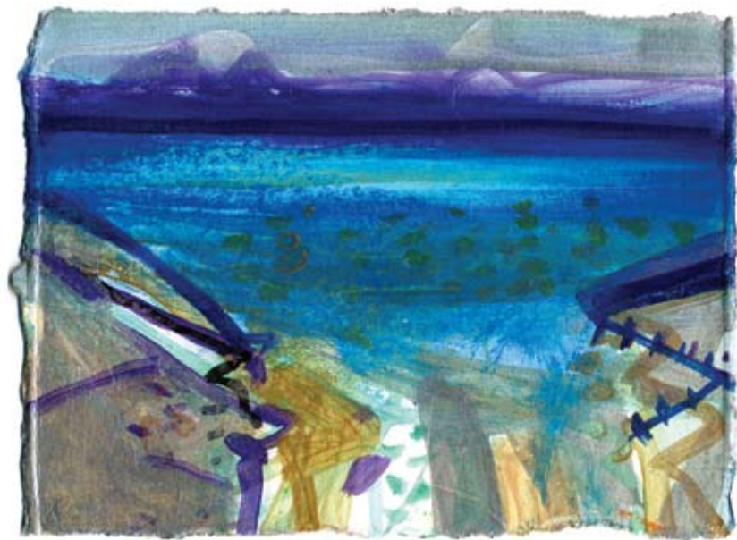
3. Applecross Tide mixed media on paper 14.5 x 19.5 cm