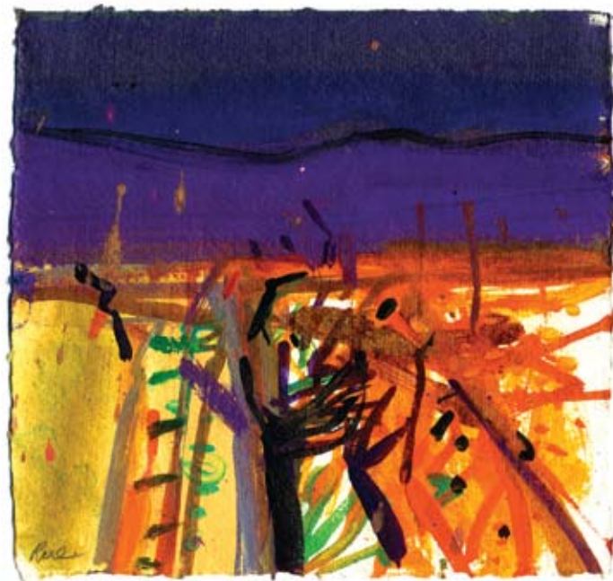
20. Vine Paths – Robion mixed media on handmade paper 21 x 22 cm