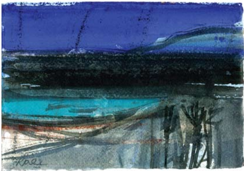
22. Sheildaig Lochan mixed media on handmade paper 15 x 21.5 cm