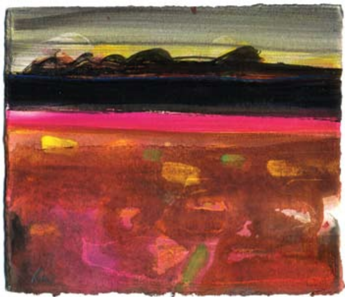
8. Sheildaig Night mixed media on handmade paper 15.5 x 17.8 cm