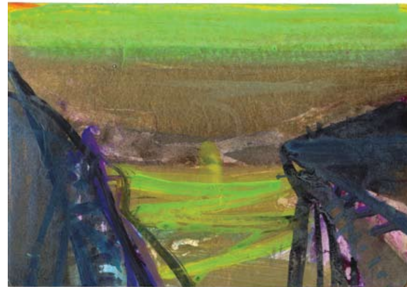
21. Winter Tide mixed media on paper 15 x 21 cm