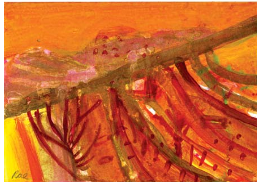
13. High Vineyard mixed media on paper 15 x 21.5 cm