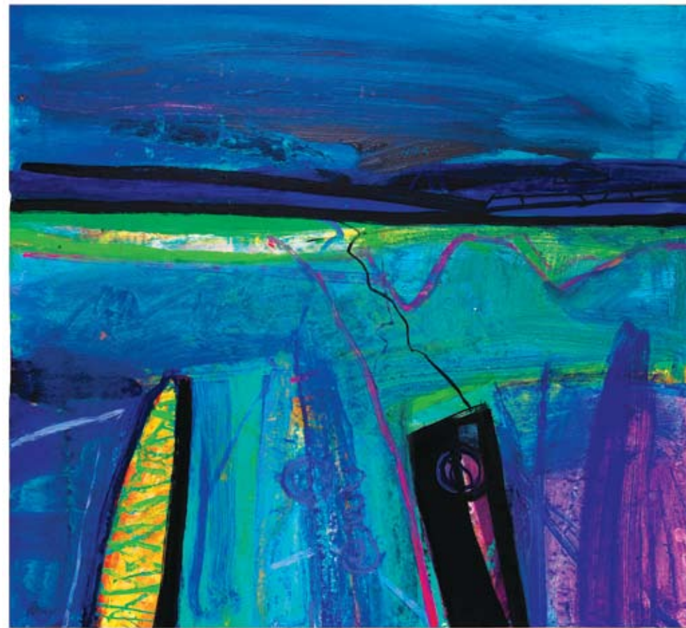
4. Dark Signs mixed media on paper 100 x 109 cm