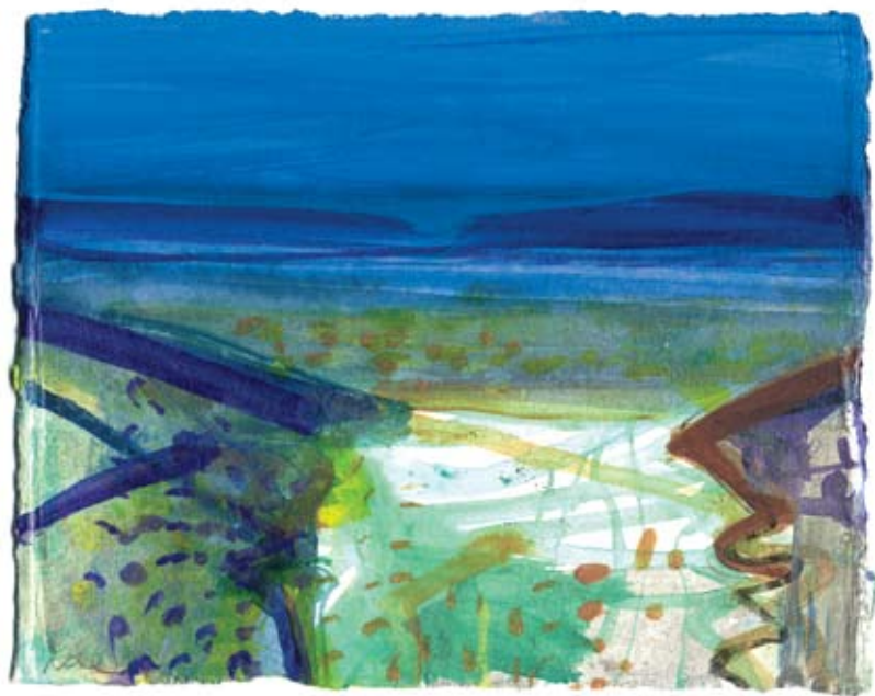
18. Opening to Raasay mixed media on handmade paper 15 x 19.2 cm