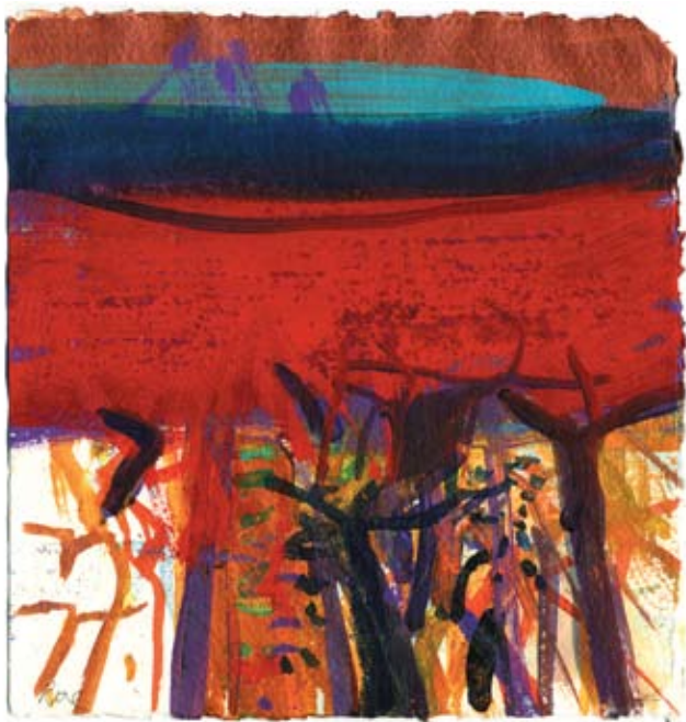
6. Favorot Field mixed media on handmade paper 21.5 x 20.5 cm